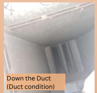
Down the Duct (Duct condition)