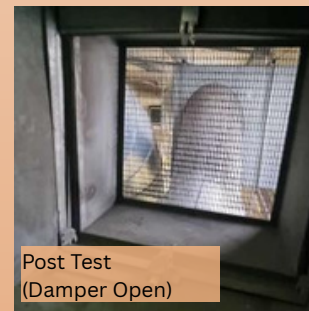
Post Test (Damper Open)